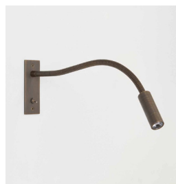
CODE: 1295003 FINISH: BRONZE

TO MAINTAIN THIS PRODUCT TO ITS BEST CONDITION, PLEASE VIEW OUR CARE AND CLEANING GUIDE ON THE SUPPORT SECTION OF THE ASTRO WEBSITE.