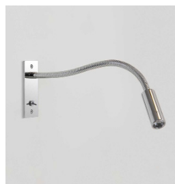
CODE: 1295001 FINISH: POLISHED CHROME