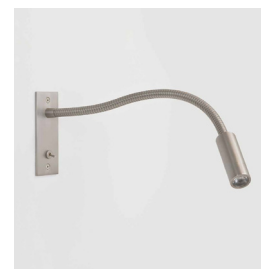
CODE: 1295002 FINISH: MATT NICKEL