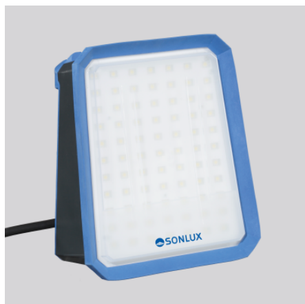
Compact lights 4017506086465 L 250, B 215, H 155