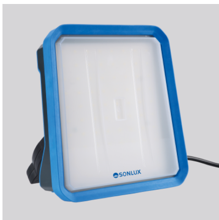
Compact lights 4017506086236 L 320, B 305, H 110