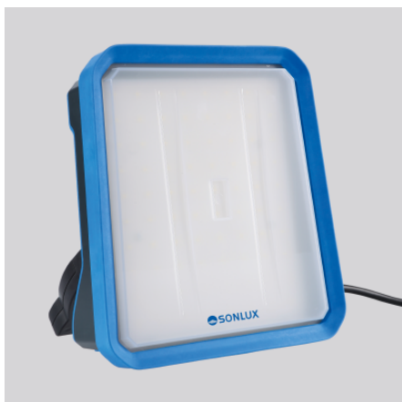
Compact lights 4017506086885 L 320, B 305, H 110