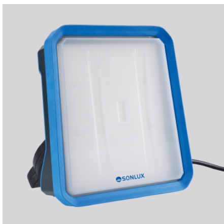
Compact lights 4017506082689 L 320, B 305, H 110