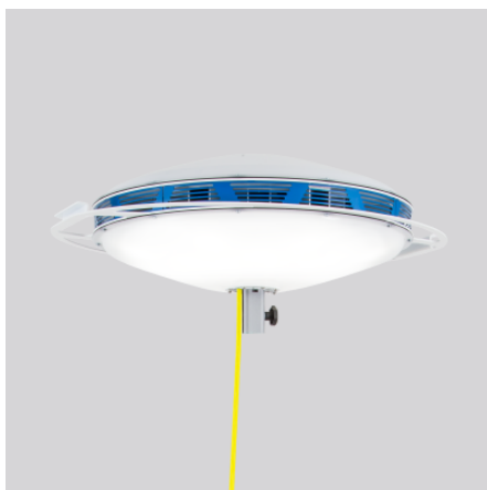
Large-area lights 4017506105357 L 750, B 630, H 250