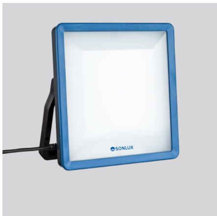
Compact lights 4017506116766 L 388, B 370, H 105