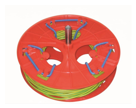
The spool is ready to be unwound