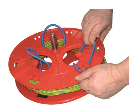
The straps are adjusted