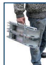
Carry it like a briefcase