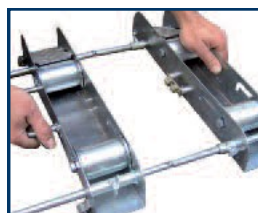
Tighten the wheel

Folds and unfolds in 3 clicks and 6 seconds