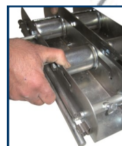
Fold the 2nd bar