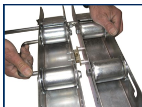
Lock the wheel