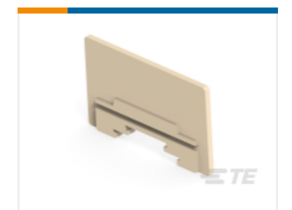
TE Part #1SNA199393R2200 SCH6