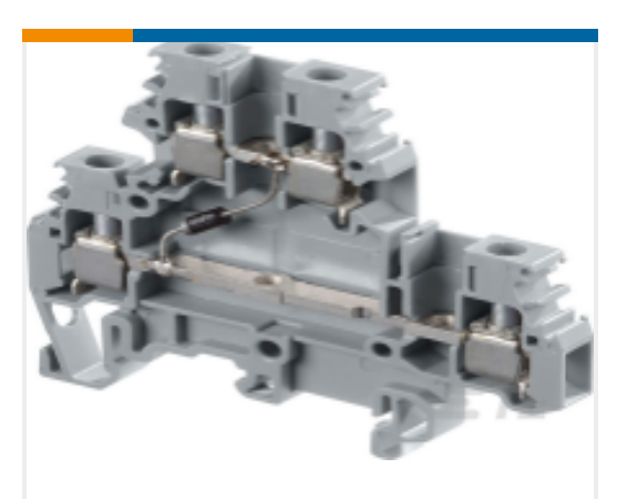
TE Part #1SNA115168R2300 M4/6.DD