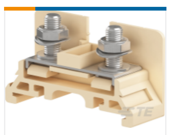
TE Part #1SNA295014R1100 HD6/13.FF4