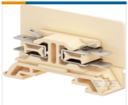
TE Part #1SNA162309R1000 HD6/14.DG